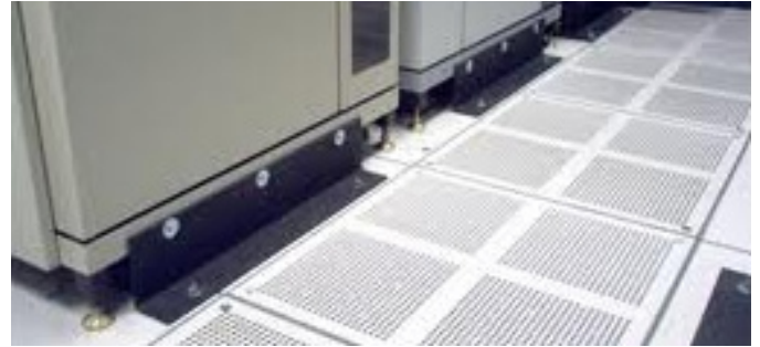
Anchoring the enclosure is worse