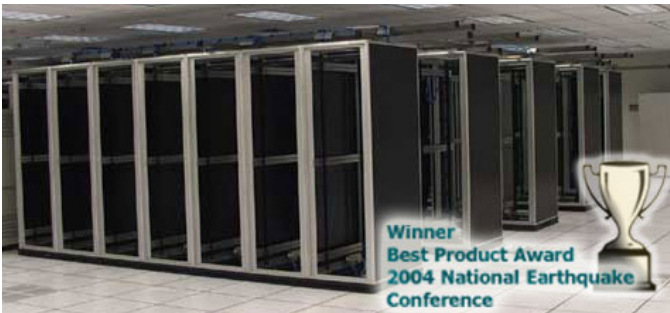
Vintage isolation platforms work up to 1g.