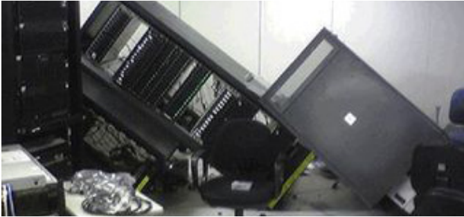
No system restraint

Acceleration destroys hard drives even at 0.5g level. Downtime is measured in $ Millions.